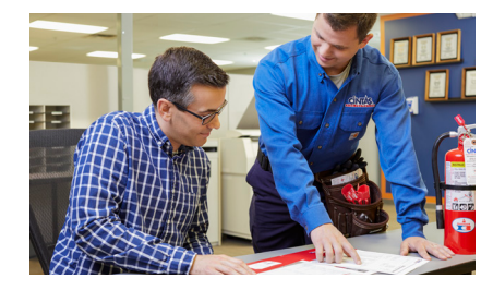
Industry-leading customer service — with 24/7 on-call support, advanced reporting technology and bundled offerings.