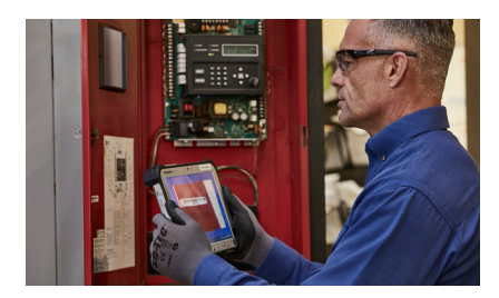
A network of technicians trained to service an extensive list of fire protection systems — all while respecting your health and safety protocol requests.